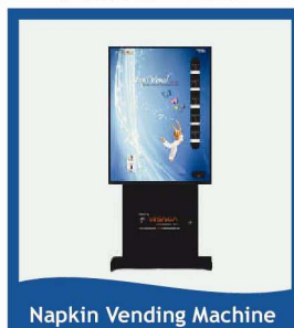
Napkin Vending Machine