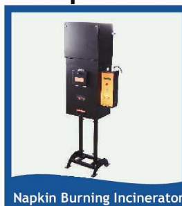
Napkin Burning Incinerator